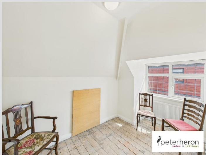
Bedroom 3 6'6" x 10'6"

Into dormer with UPVC double glazed window to side, single radiator and access point to eaves storage.