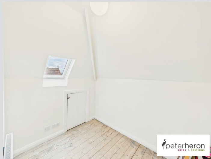
Bedroom 4 6'2" x 8'5"

Velux window, eaves storage cupboard and single radiator.